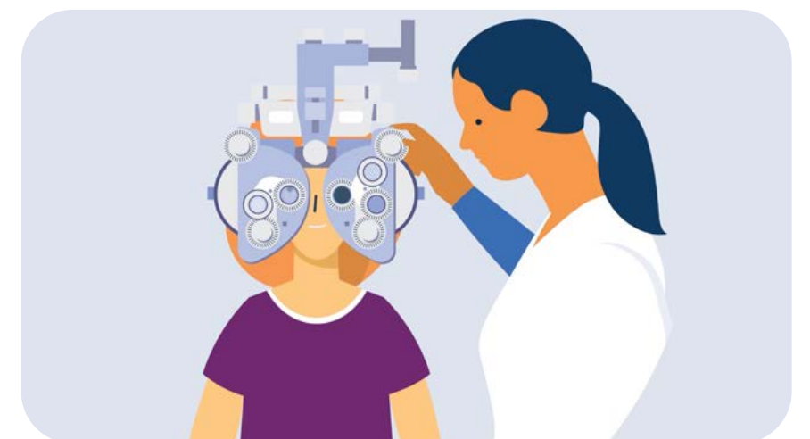
We cut to a young girl having her vision examined. VO: ...vision care is covered for children and teens who have Medicaid and CHIP.