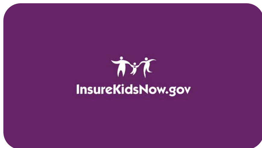
SUPER: InsureKidsNow.gov. Open on the InsureKidsNow.gov logo.