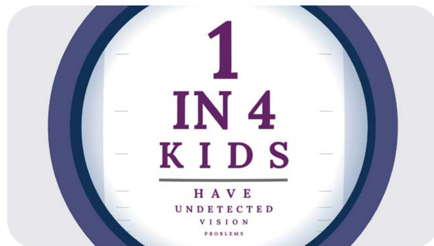
We see a vision chart that is out of focus and adjusts into focus. VO: While 1 in 4 kids have undetected vision problems,...