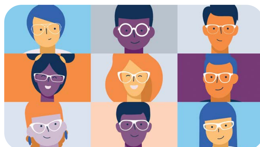
The camera pulls back to reveal multiple children smiling and wearing glasses. VO: ...is available in your state.