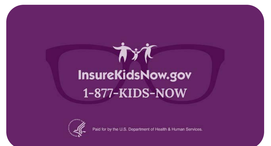
Transition to the end card. SUPER: InsureKidsNow.gov 1-877-KIDS-NOW Paid for by the U.S. Department of Health & Human Services. VO: Learn more at InsureKidsNow.gov. Paid for by the U.S. Department of Health & Human Services.