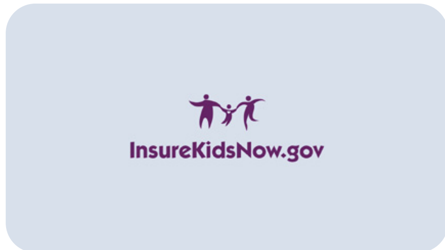
SUPER: InsureKidsNow.gov. Open on the InsureKidsNow.gov logo.