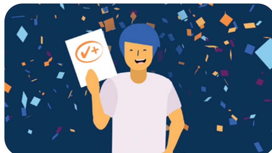
Again, the boy stays in place and the scene changes to the boy holding up a report card. Confetti falls around him. VO: ...for those who are eligible.