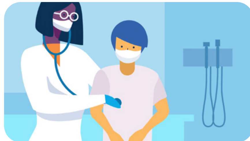
Open on a boy being examined by a doctor. VO: Kids who have health coverage...