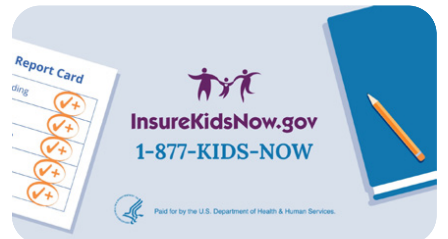
SUPER: InsureKidsNow.gov 1-877-KIDS-NOW Paid for by the U.S. Department of Health & Human Services. VO: Learn more at InsureKidsNow.gov. Paid for by the U.S. Department of Health & Human Services.